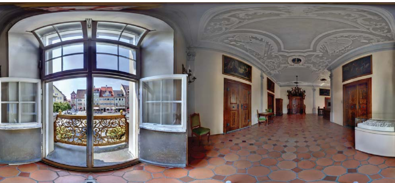
photo-realistic colored scan with the i-Cam of the townhall Wangen

The IMAGER 5010C can also take colour images without any set-up times.