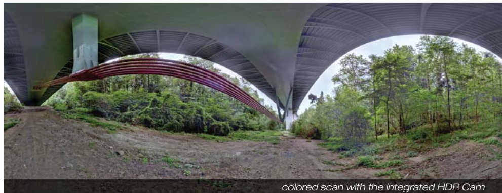
colored scan with the integrated HDR Cam

The 3D phase based laser scanner Z+F IMAGER 5010C enables a detailed condition and damage assessment of the current status of a building or complex structure and its surroundings. From the 3D data it is easy to create 2D floor plans or views of the object to plan building or conversion projects.