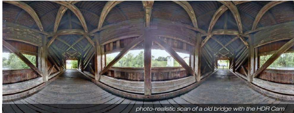
photo-realistic scan of a old bridge with the HDR Cam

The Z+F IMAGER 5010C sets an impressive record in this field because of its contact-free, and above all rapid measuring ability. This reduces costs tremendously in comparison to traditional measurement systems. The integrated Z+F i-Cam enables the whole point cloud to be coloured, which gives a photorealistic impression of a scan with a high level of detail.