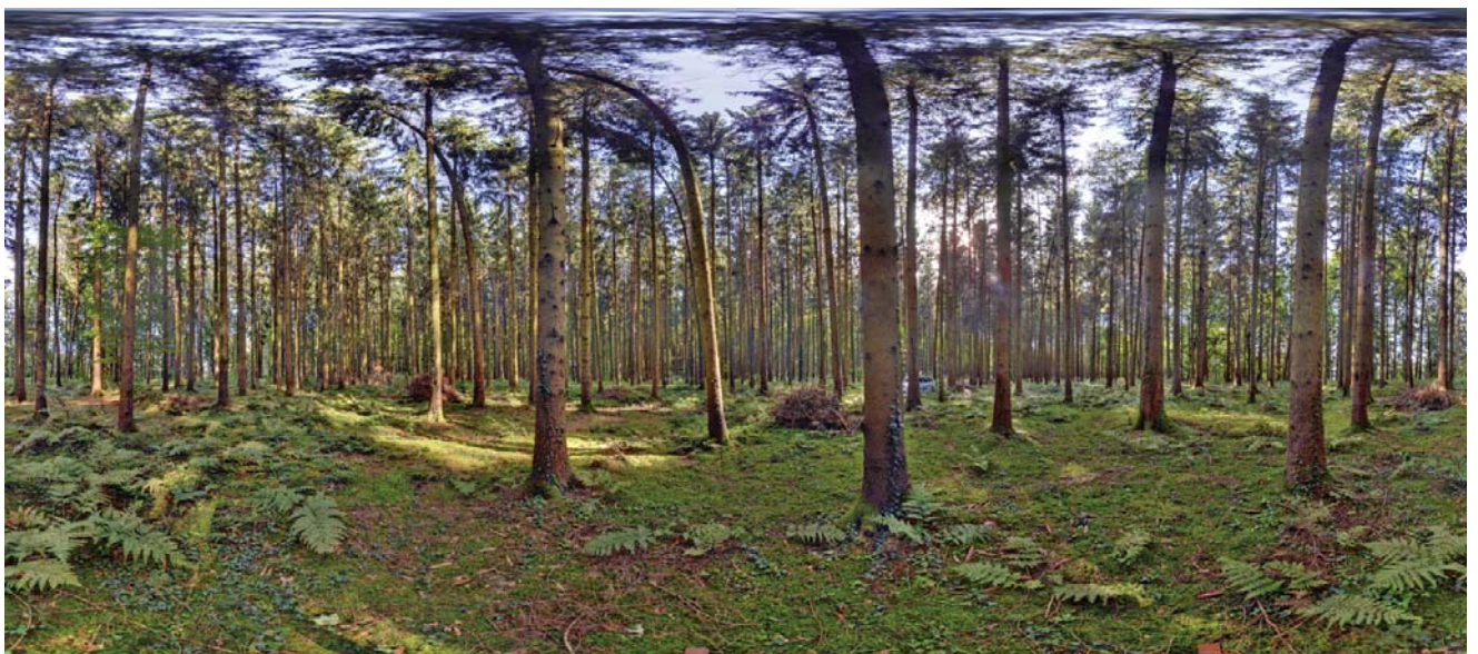
photo-realistic forest image with i-Cam