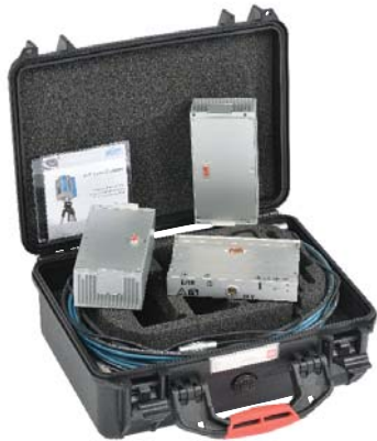
The hard case ensures the safe storage of the accessories

Every Z+F laser scanner is delivered with an accessory case that includes the following items: