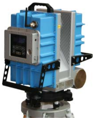
Explosion proof: IMAGER 5006EX

Apart from the Z+F IMAGER for 3D laser scanning, other devices were developed as well. The Z+F PROFILER, a 2D laser measuring device for kinematic applications use, appeared on the market in 2002. These instruments are designed for the use on mobile platforms such as railway or road vehicles. The development stages of the PROFILER are identical to those of the Z+F IMAGER.