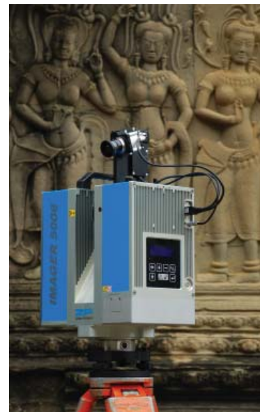
In operation in Angkor Wat: Z+F IMAGER 5006i

The relationship to costumers and partners is most important for Zoller + Fröhlich. Users worldwide appreciate our personal service and technical support. Today Zoller + Fröhlich is one of the leading enterprises in the field of contact-free laser measuring technology. Thanks to years of practise and countless concluded projects, we built a wealth of experience and success. At present, Zoller + Fröhlich is represented in 40 different countries with branches in England and USA, and many sales co-operations throughout the world. The success of Zoller + Fröhlich can be attributed to first-class service and personal advice.