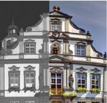
Town hall Wangen im Allgäu in 3D view

The new Z+F IMAGER 5010C is highly precise, reliable and flexible. These improvements can be appreciated in your daily work.