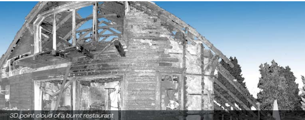
3D point cloud of a burnt restaurant