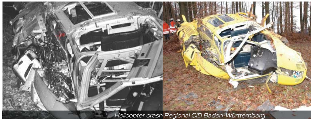
Helicopter crash Regional CID Baden-Württemberg

The decisive advantage of the IMAGER in forensics is the immense speed. The crime scene can be documented holistically without interfering with the running investigation. The high resolution enables to capture even inconspicuous details being preserved as evidence.