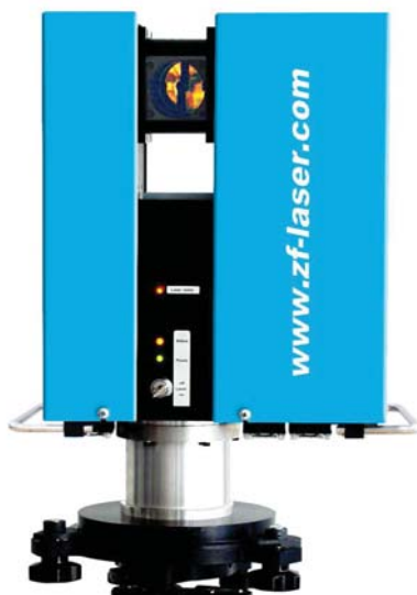
The first compact device: Z+F IMAGER 5003

In 2006, the success story of the IMAGER series was continued with the Z+F IMAGER 5006. Thanks to its integrated control panel, a powerful internal PC, hard disk and internal battery, the IMAGER 5006 was the first stand-alone 3D laser-scanner worldwide.