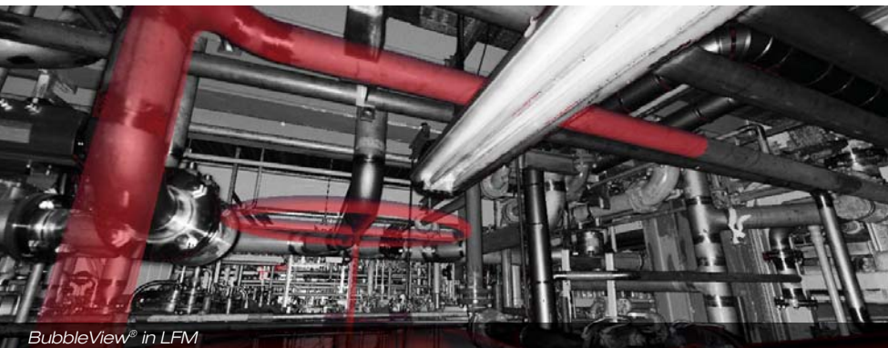
BubbleView® in LFM

The high resolution allow the Z+F IMAGER 5010C to “freeze” scenes rapidly for later analysis and in extraordinary quality. In this case, the data serves mainly for preserving evidence and documenting damage. This leads to great time savings for accident reconstruction and many other insurance purposes.